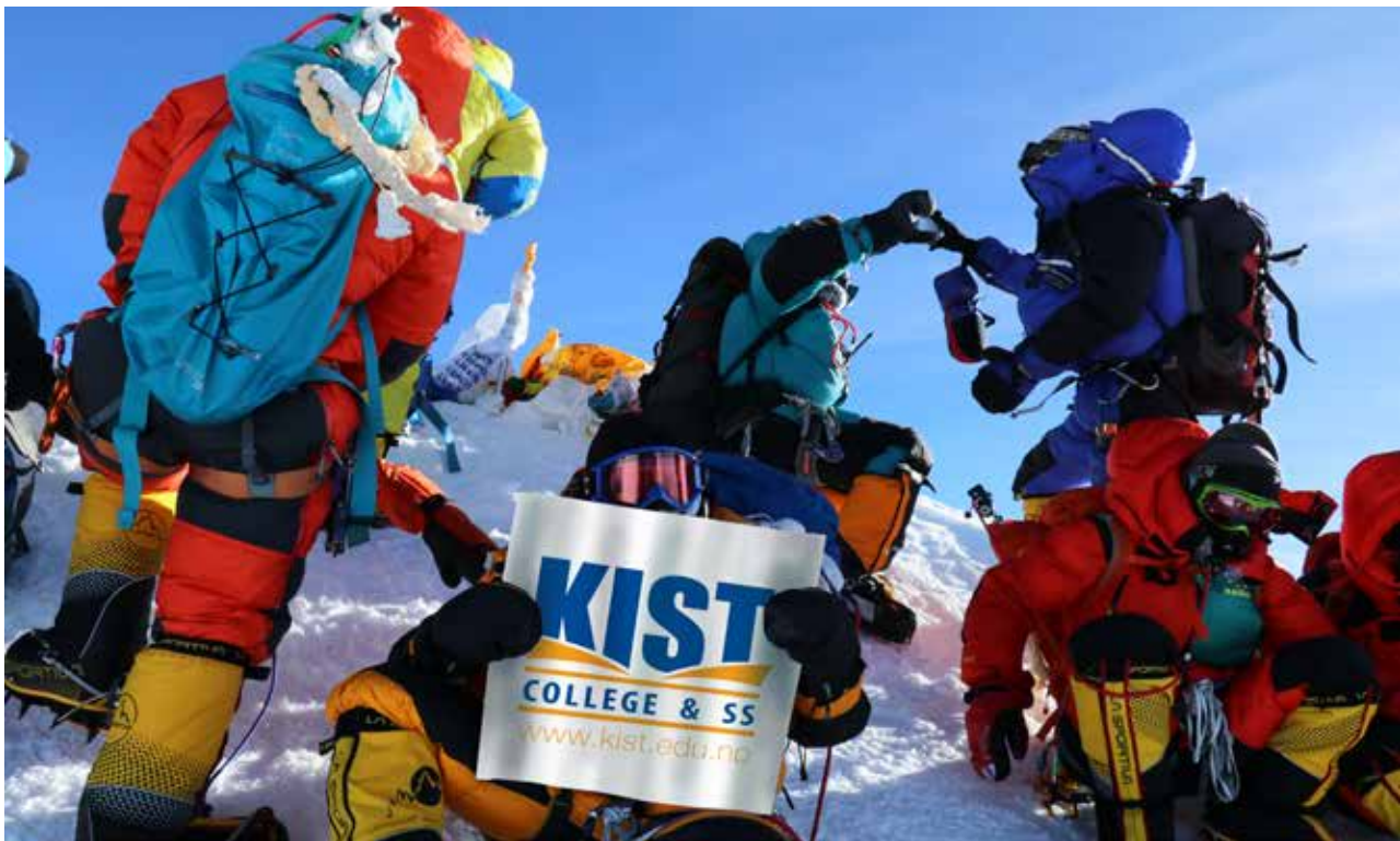
At the Top