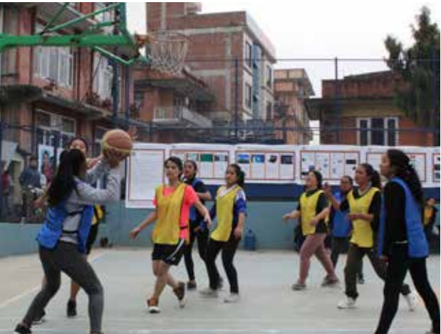
Girls Basketball Tournament