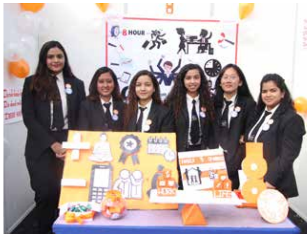
Project Demonstration, KIST Fair