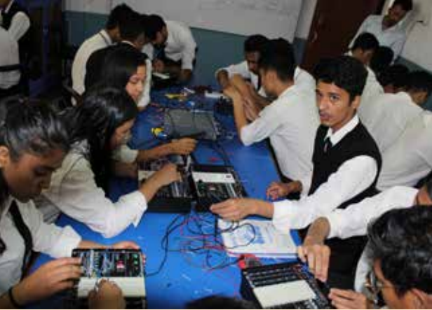
Digital Logic & Electronics Lab