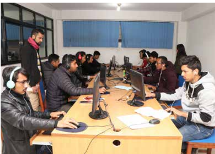
KIST Fair Gaming Competition