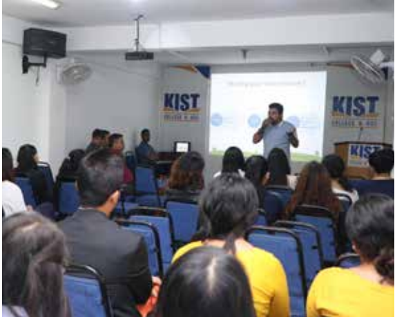
Business Plan Competition