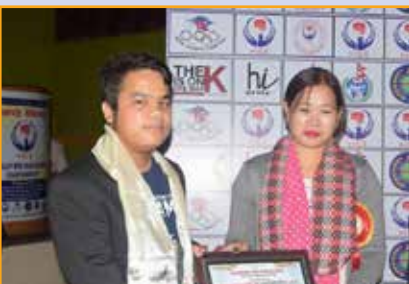
MF Kumite Scoreboard and Tiesheet Software Developer Honoring by Intl. Wado Federation Nepal.

Enthrallingly, what’s really important about KIST is that its highly qualified and experienced lecturers make lectures and talks most engaging and fruitful. Expert advice about anything of relevance to students is almost instantly available. Definitely it is one of the best institutions around and this makes every student so glad to be an integral part of it. Come, and see things for yourself. . . With a range of growth-oriented opportunities spanning academics, extracurricular and co-curricular activities, we are all about scholastic excellence and professional development. The College fully taps the potential of its students in an enjoyable and effective manner. Your next chapter in life starts right here. At KIST!