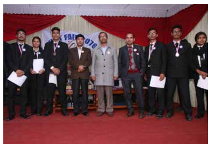
Winners, Imgeeneering Competition