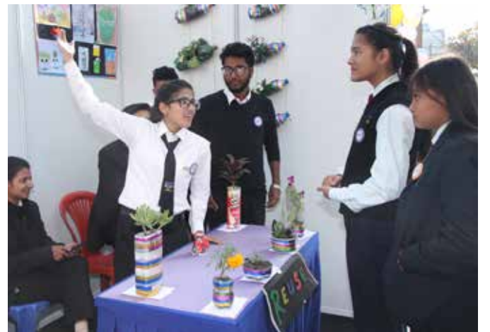
Reduce, Reuse, & Recycle of Plastic Waste