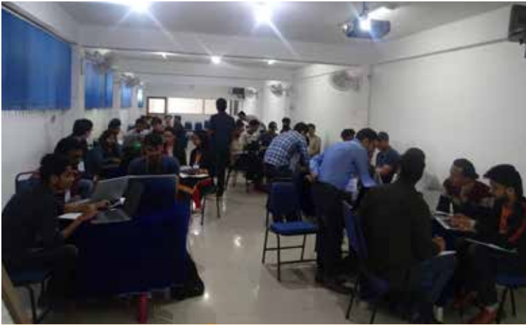
Machine Learning & Data Science Workshop