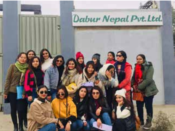
Industrial Visit, Dabur Nepal, Jitpur, Bara