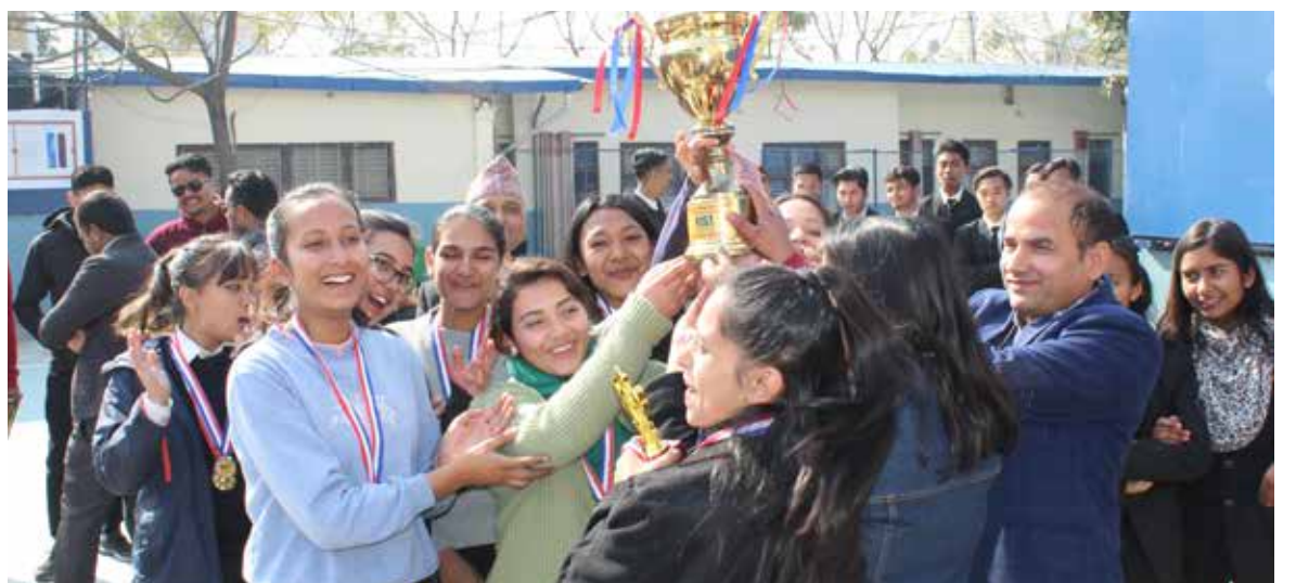
Winners, Intra-College Basketball Tournament