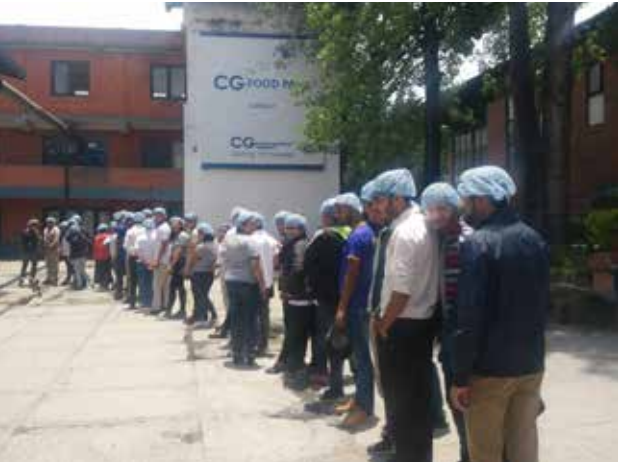
Industrial Visit, CG Food