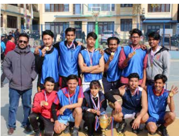
Winners, Intra-College Basketball Competition