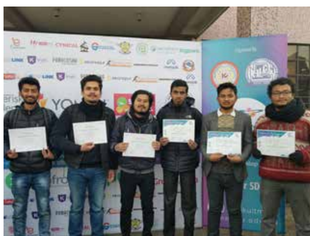
Winners, KU IT Meet