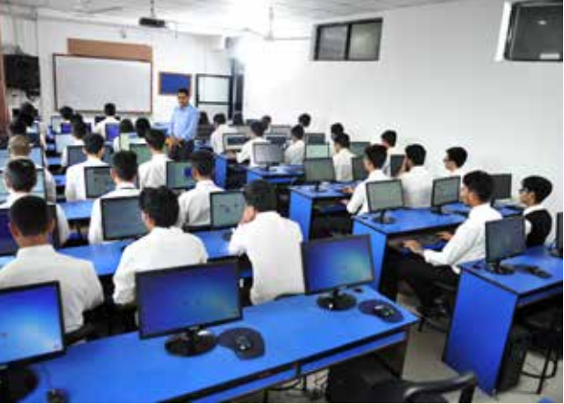
C Programming Project