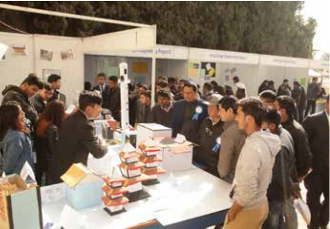
Intra College Image Engineering Competition, KIST Fair