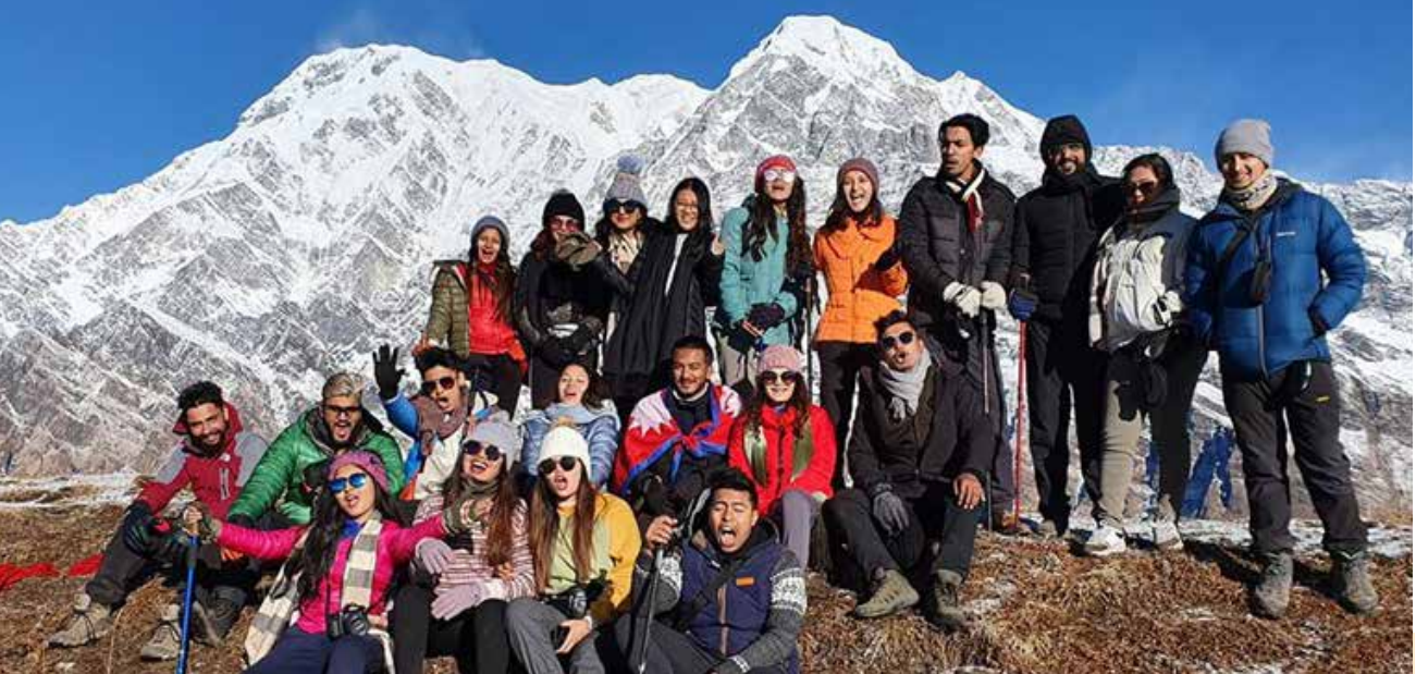
Mardi Himal Trek