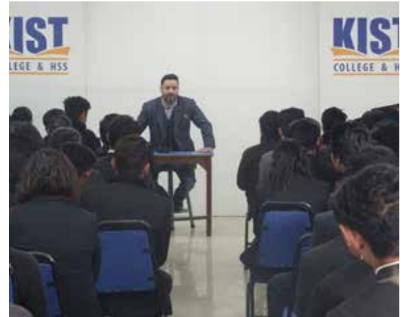
Interaction with Suraj Singh Thakuri, Media Personality