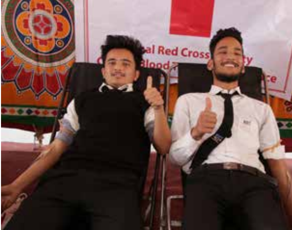
Blood Donation Program